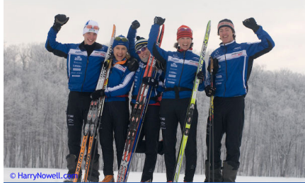
Successful Eastern Canadian Championships